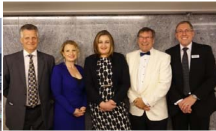
Roll of Honour – (left to right)