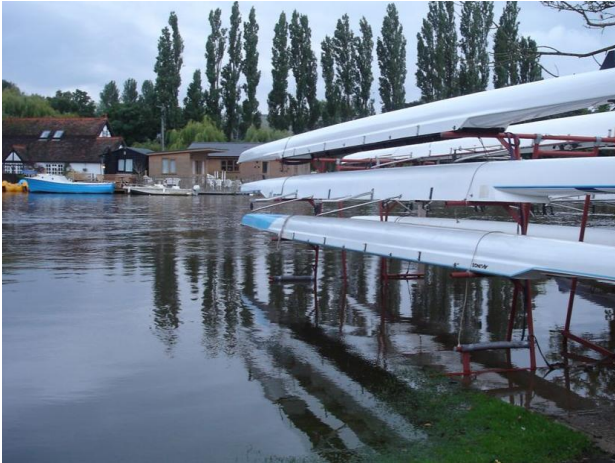
The venue under water