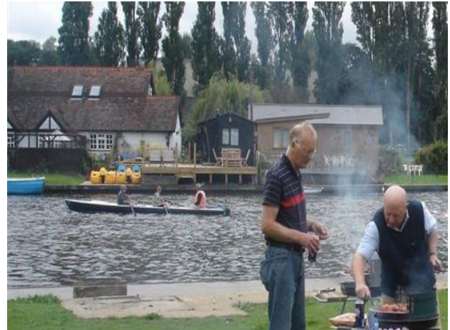
Action on the water

Quiet talk of possible success in the forthcoming Rugby World Cup saw everyone in good spirits (little did we know the events that would unfold in the coming months!).