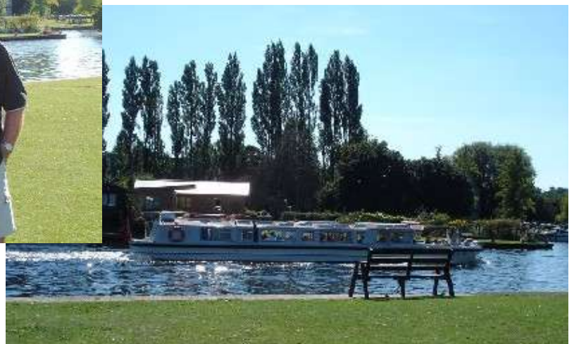
The easy life at Henley.